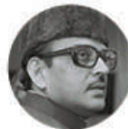
Vishwanath Pratap Singh [Former Prime Minister of India]

“ I do not think Jamia Urdu is merely an examining body. It's efforts and activities reflect its objectives for propagating education to poor and marginalised sections of the society. The services of institutions like Jamia Urdu in eliminating the darkness of illiteracy from the country is remarkable. Jamia Urdu has served the country in general and education in particular. ”