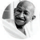
Mohandas Karamchand Gandhi [Father of the Nation]

“ Urdu language is a heritage of the pluralistic culture of our country. Jamia Urdu Aligarh deserve all compliments for everything Jamia Urdu is doing for the promotion of Urdu. My best wishes are with Jamia Urdu. ”