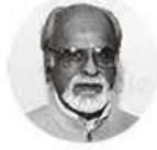
Indra Kumar Gujral [Former Prime Minister of India]

" It is a matter of great pride for me that today Jamia Urdu has conferred its degree on me. The degree is an invaluable gift to me especially because this way I have become associated with an institution of historical character which is highly respectable to me. Highlighting the importance of Jamia Urdu before you would be imprudence. However, my thoughts stray to the circumstances that compelled such great people to establish an institution like Jamia Urdu. "