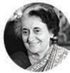
Mrs. Indira Gandhi [Former Prime Minister of India]

“ It is pleasing to know about the success of Jamia Urdu. I congratulate you for the way this institution is serving the Urdu language. I am grateful that Jamia Urdu has conferred its degree on me. It would be an honour for me if I am able to do something for it. Urdu is the language of our country and is loved throughout the world and all efforts should be made for its development. Besides the government, it is the duty of citizens of India to come forward and cooperate with Jamia Urdu in the development of Urdu. ”