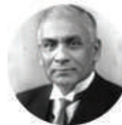
Dr. Sir Tej Bahadur Sapru

" I feel pleased to learn about the result of your (Jamia's) examination. I hope the activities of Jamia Urdu will increase everyday and the people who are rendering their services will succeed in their objectives. "